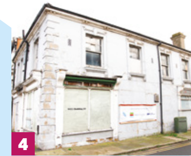
4 HUTTON RD.