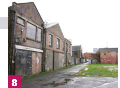
8 MACLURE ST.