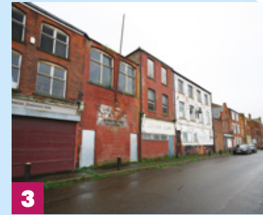
3 FISH DOCK RD.