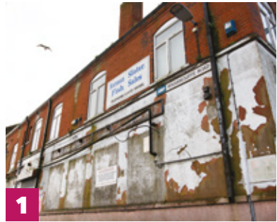
1 WHARNCLIFFE RD.