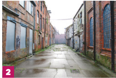
2 HENDERSON ST.