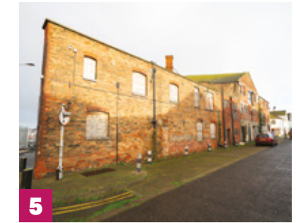
5 CROSS ST. CORNER