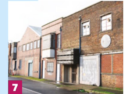
7 AUCKLAND RD.