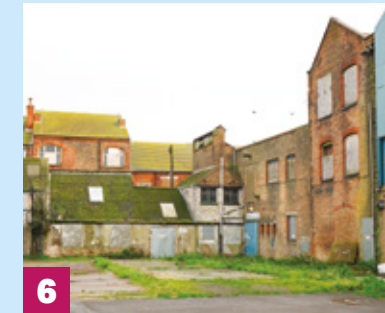
6 THE SQUARE